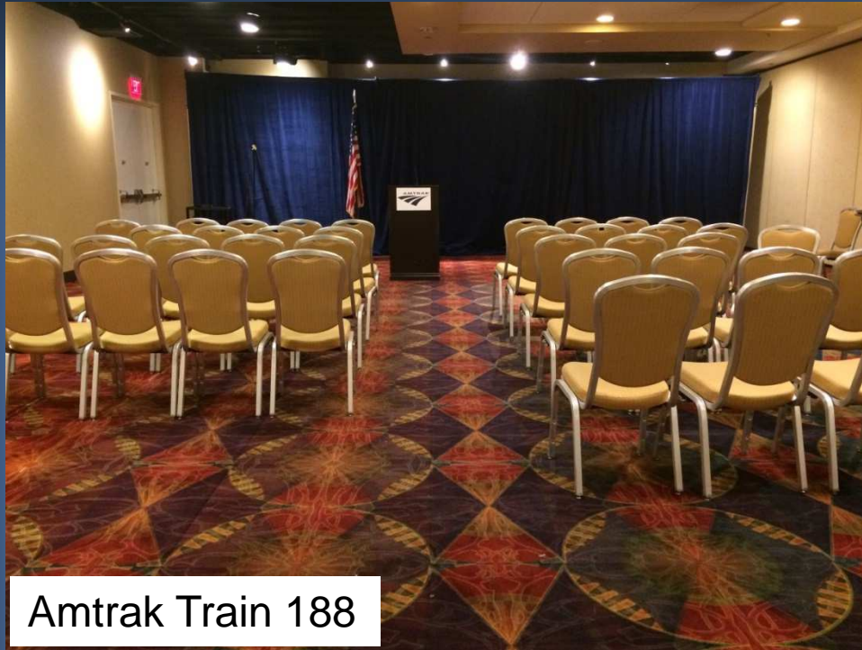
Amtrak Train 188