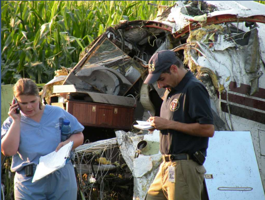
Facilitating victim recovery and identification; East Coast Jets Flight 81; Owatonna, MN