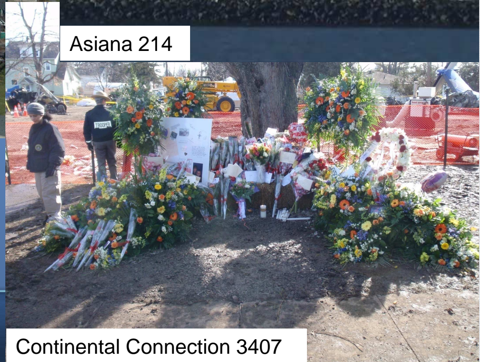
Continental Connection 3407