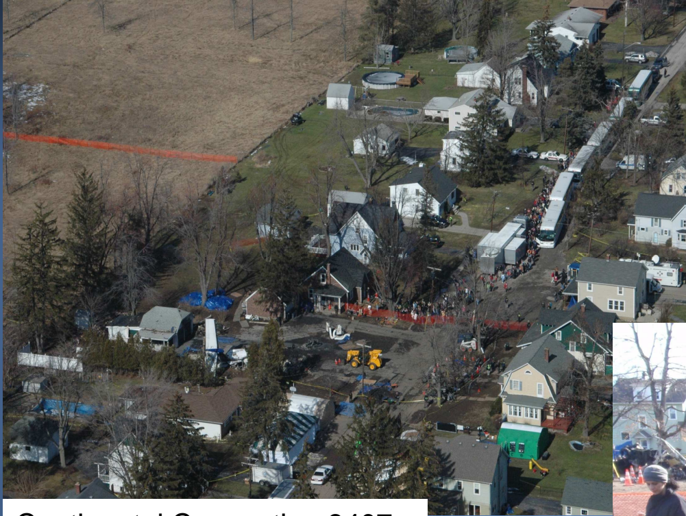
Continental Connection 3407